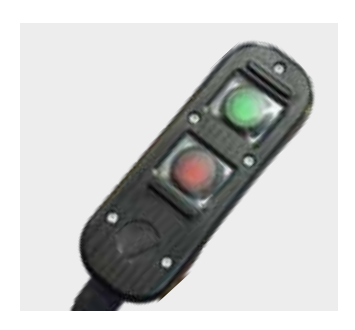
The HY-Series Pump has a heavy duty remote to handle the harshest conditions. The simple 2-button setup makes operations user friendly.