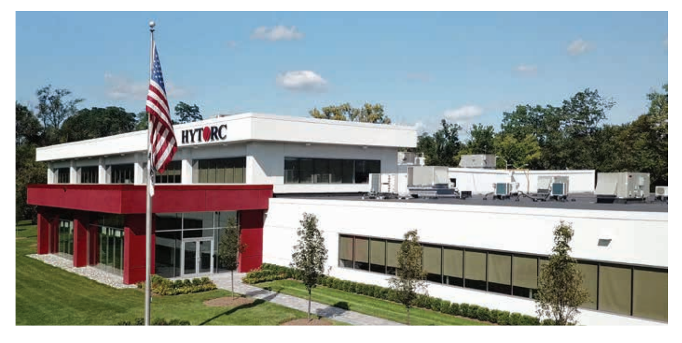
HYTORC MISSION STATEMENT

HYTORC'S MISSION IS TO OPTIMIZE SAFETY, QUALITY AND SCHEDULE IN INDUSTRIAL BOLTING THROUGH INNOVATIVE SOLUTIONS, AND AN UNYIELDING COMMITMENT TO WORLD-CLASS CUSTOMER SERVICE.